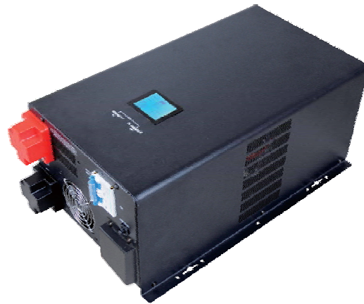
2500W ~ 3500W

The Pure Sine Wave Inverter is desirable long backup power solution for home and office appliances. It is not only an inverter but also contains a powerful intelligent charger. It provides pure sine wave power to all kinds of loads. And it can be used as UPS for computers as well.