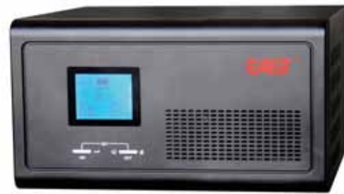
300W ~ 1600W